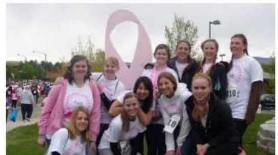
Teen Advisory Committee members pose at a race for the cure last year.

Registering for our team is simple, and only takes a few minutes. Go to http://www.komenboise.org/ and click "Register" under the "Komen Race for the Cure" tab. On the right side of the screen, click "Join a Team". On the next page, you can search for our team by name (Girl Scouts of Silver Sage Council) or by division (Non-profit). Once you have found our team, click "Join" and fill out the registration form! The cost is $20 for ages 13 and up and $10 for youth ages 12 and under, and 100% of that cost goes towards local mammogram and treatment funding and national research for a cure. Each participant will receive a t-shirt to wear on race day and all team members who register before March 31 st will receive a free wristband from Susan G. Komen. →