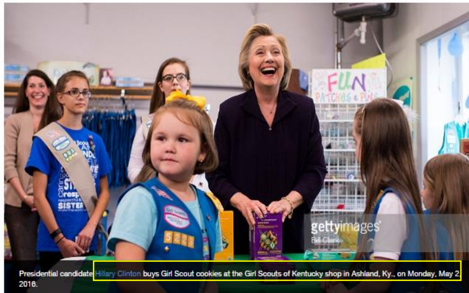
Presidential candidate Hillary Clinton buys Girl Scout cookies at the Girl Scouts of Kentucky shop in Ashland, Ky., on Monday, May 2, 2016.

documentation continued on following page