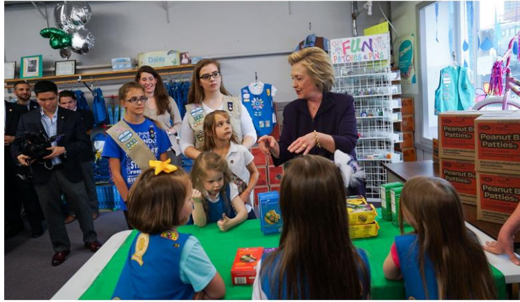
May 2, 2016: In Ashland, Kentucky, Hillary signed badge-covered Girl Scout vests and talked about her days as a Brownie. "I have eaten a lot of these in my life," she said as the girls helped her choose boxes of cookies to buy.

The visit, on May 2, 2016, at the Girl Scouts of Kentucky's Wilderness Road council shop in Ashland, KY ( http://www.gettyimages.ae/detail/news-photo/presidential-candidate-hillary-clinton-buys-girl-scout-news-photo/527449452 / http://www.gskentucky.org/en/our-council/shops.html ), included uniformed Girl Scout members from the youngest (Daisy K/1st grades) to oldest (Cadette/Senior/Ambassador) http://www.girlscoutshop.com/s.nl/sc.20/f .