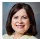
The Honorable Leticia Van de Putte State Senator for District 26, Texas Legislature

See also http://www.girlscouts-swtx.org/alumnae/girl-scout-greats/the-honorable-leticia-van-de-putte.html