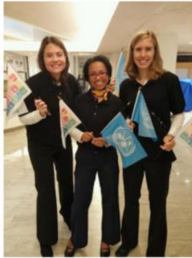
WAGGGS Delegates at the Adoption of the Global Goals

wagggsunteamnyc.blogspot.com/2015/10/waggggs-and-adoption-of-un-global-goals.html